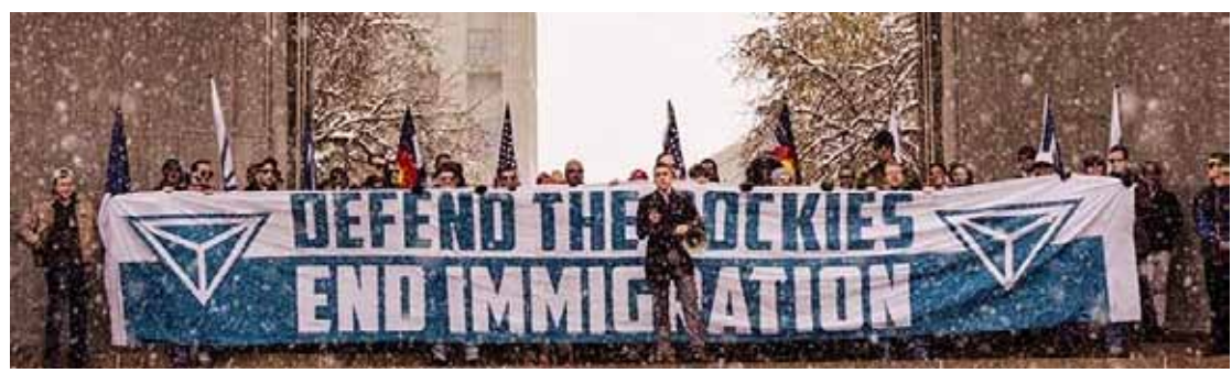
Individuals associated with Identity Evropa gathered in Denver's Civic Center Park in November 2018.