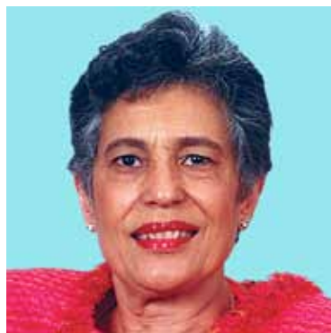
Carlotta Walls LaNier

Ticket proceeds and sponsorships benefit youth-led initiatives to promote respect and address all forms of bias and bullying. When schools are safer and more inclusive, students are better able to thrive academically and socially. ●