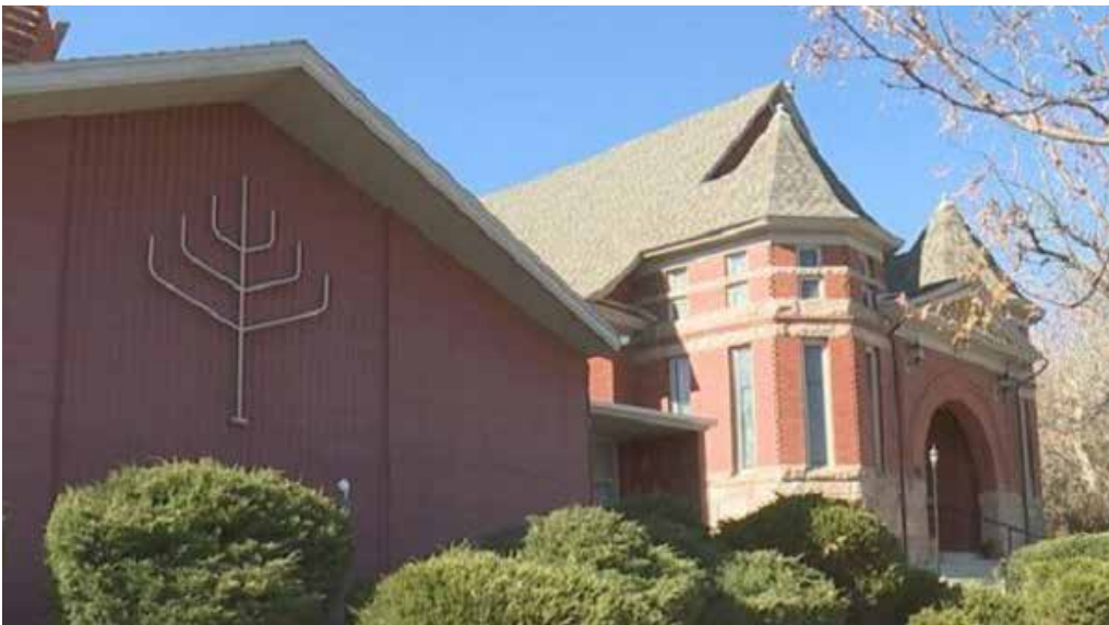
Temple Emanuel, Pueblo, CO