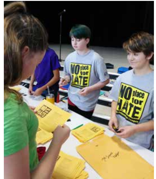
Students from Lucile Erwin Middle School in Loveland, Colorado participate in a No Place for Hate training.

Building inclusive and safe communities and empowering students, faculty, administration and families to take a stand against hate and bullying does not happen overnight. Quick solutions might sound desirable, but ADL knows that creating real and lasting changes to the culture of a school community takes time, multiple strategies and commitment by all stakeholders. The enduring work of No Place for Hate helps to ensure that positive school culture is not just created but sustained over time. Congratulations to all of our students, teachers, administrators and families who are partnering with ADL on the hard work of creating inclusive and respectful school communities. ●