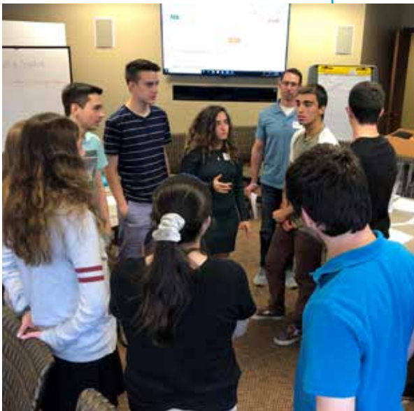
Members of the Denver Jewish Day School 2019 senior class participate in a Words to Action training at ADL.