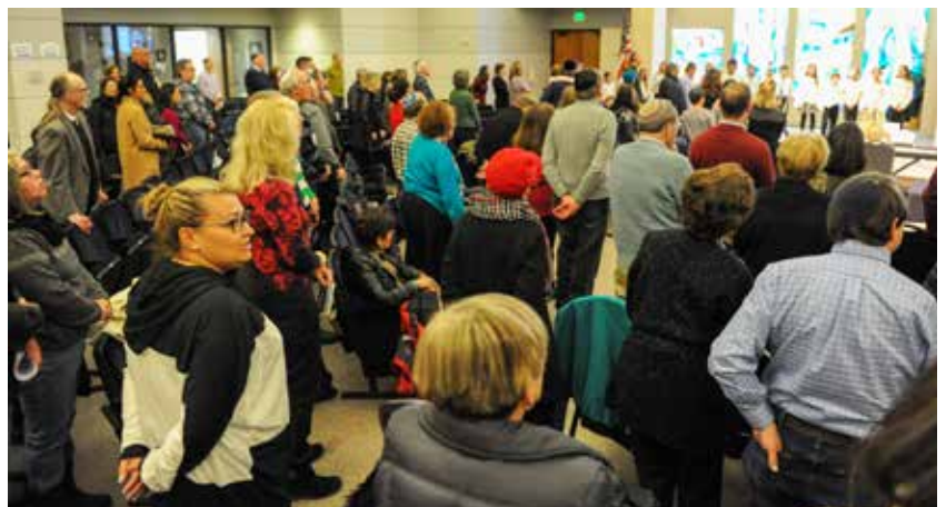
More than 300 participants attended the community memorial.