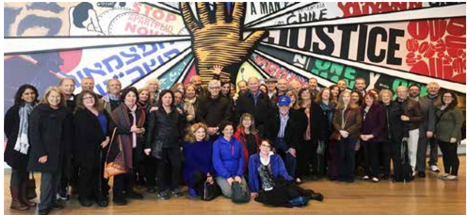
Members of the ADL Civil Rights Mission visit the National Center for Civil and Human Rights in Atlanta, GA on February 16.