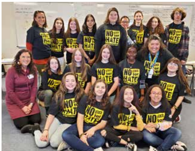
The 2019-2020 No Place for Hate Coalition at the Mandela International Magnet School, Santa Fe, NM.

ADL continues to work on initiatives to counter antisemitism and hate in the New Mexico community.